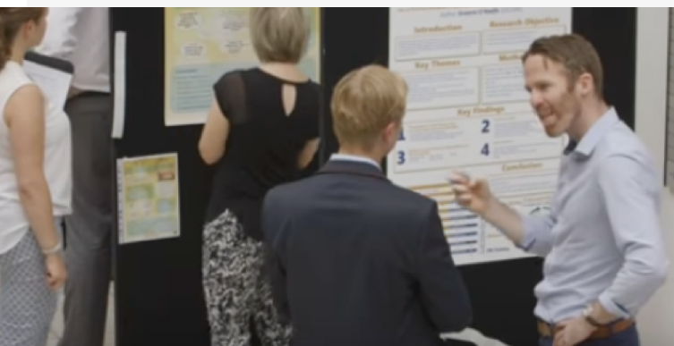
Figure 3: Students discussing their research at their posters