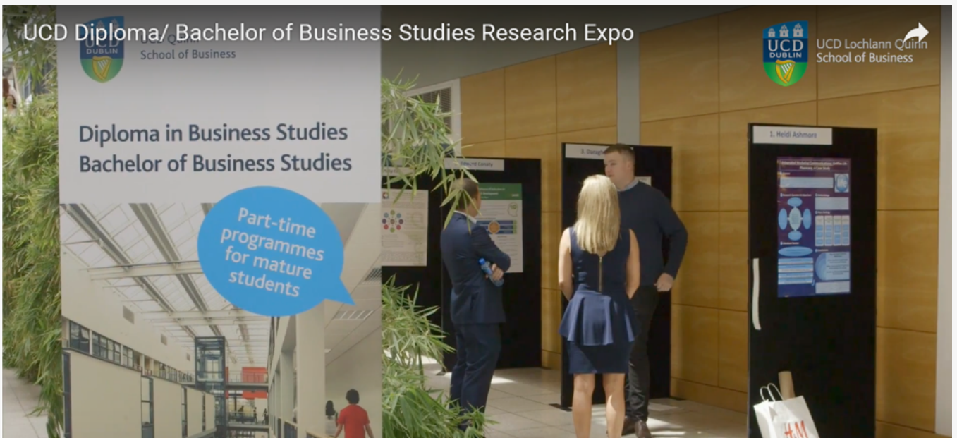
Figure 1: Student Research Expo