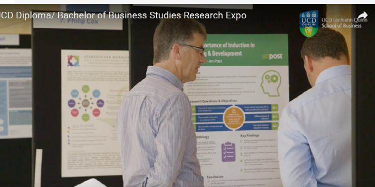
Figure 5: Academic judge and students discussing research findings